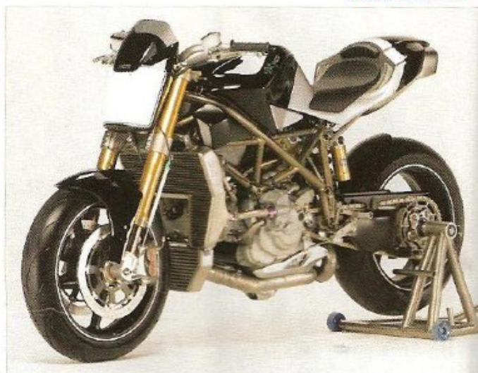
NCR's Macchia Nera Prototype